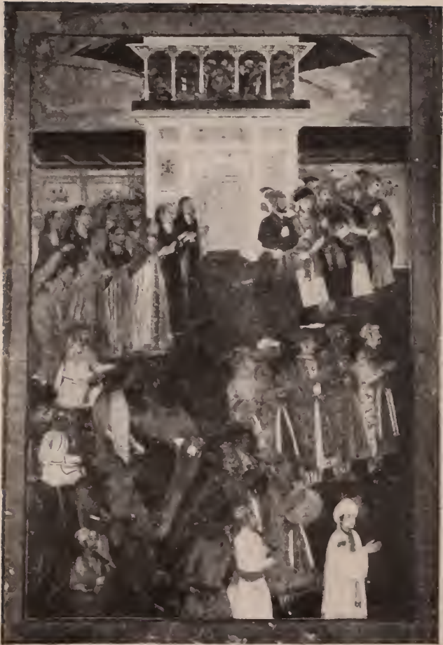
MOGHAL PICTURE, REPRESENTING THE CELEBRATIONS AT THE BIRTH OF SHAH JEHAN (LATE SIXTEENTH CENTURY).